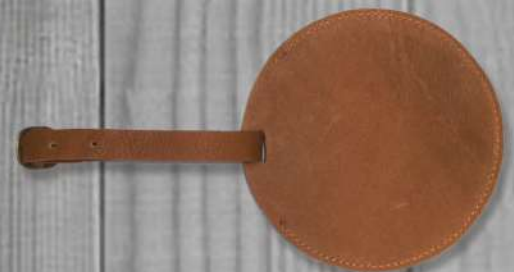
Bag Tag #90637 (4" Diam)