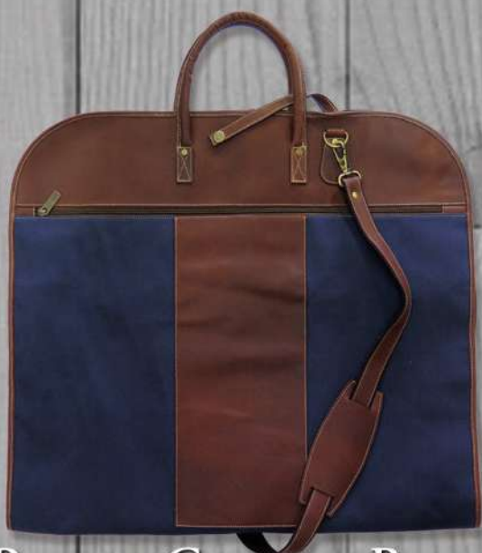
Regatta Garment Bag #94216 (23.5"x 1.5"x 42")