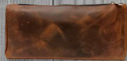
Cody Pouch #95504 (10.5" x 1.5" x 5.25")