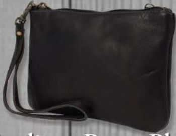
Stadium Purse Plus #95109 (7.5" x 5")