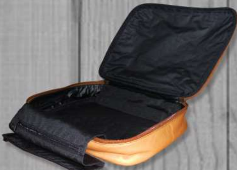
Executive Travel Case #90213 (12" x 9.5" x 2.5")