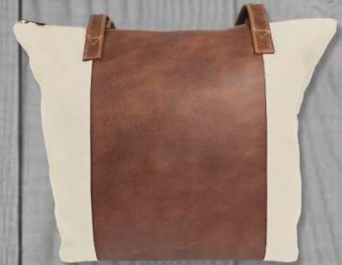
Panama Tote #94401 (11.5" x 5" x 12.5")