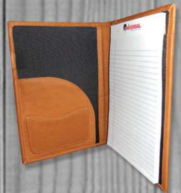
Jot Portfolio #96039 (6.25" x 8.75")