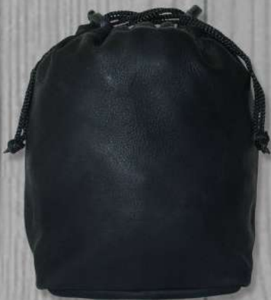
Pro Pouch #94931 (7.5" x 3.5" x 7.5")