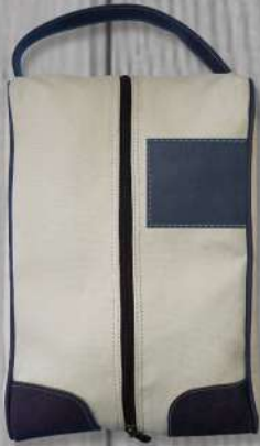
Nova Shoe Bag #99691 (9.25"x 4.5"x 13.5")