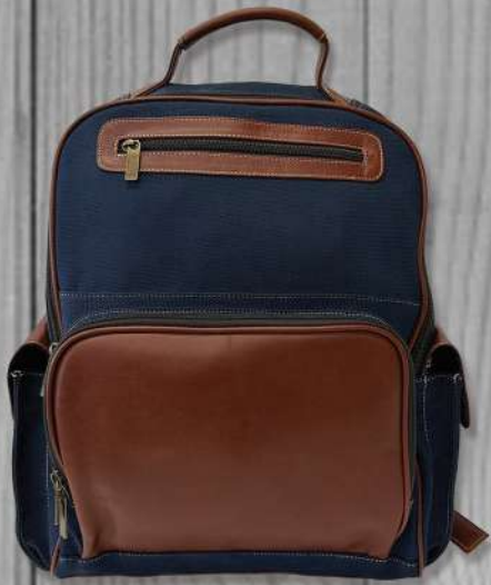
Admiral Backpack #94529 (14" x 8" x 17")