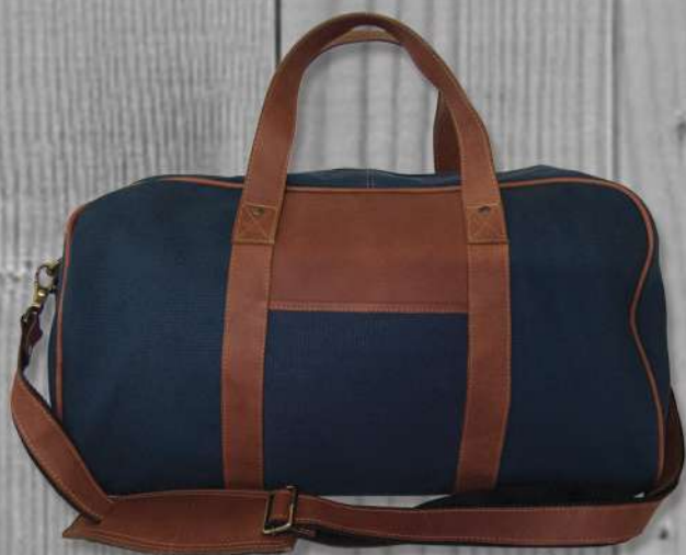
Captain's Duffle #92089 (18"x 12"x 8")