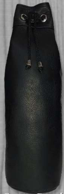
Spirits Pouch #95230 (13.5" x 4" Diam)