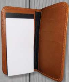
Pocket Manager #90175 (4" x 7")