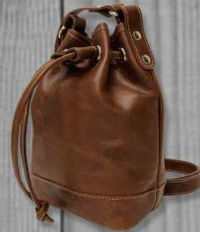
Ella Bucket Crossbody #95276 (8" x 5.5" x 3.5")