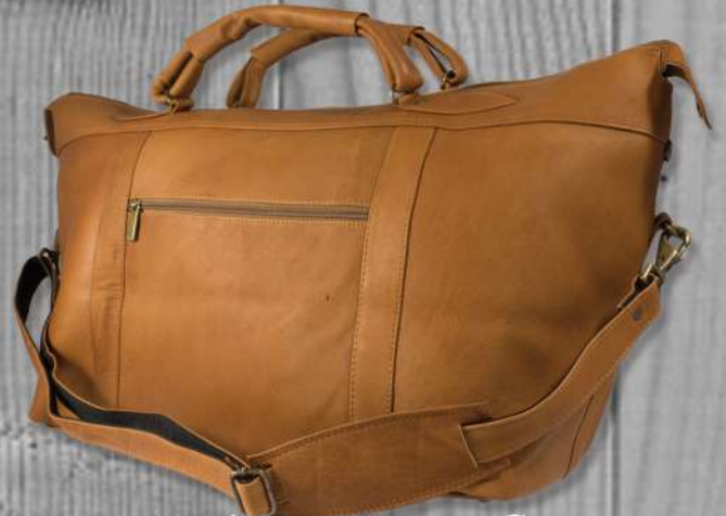
Tradition Duffle #93039 (20"x 14"x 10")