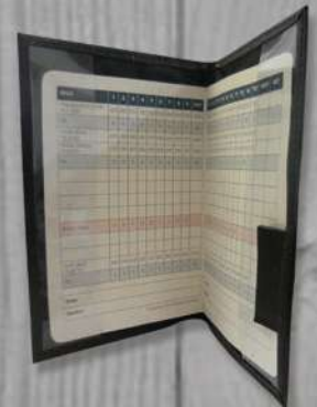
Scorecard Book #90764w (6.5" x 4.5") #90764x (5.75" x 3.3")