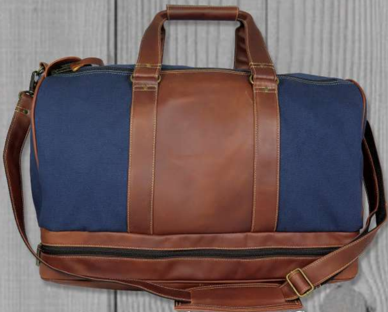
Commodore Duffle #90410 (20"x 10.5"x 12")