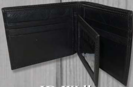
ID Wallet #90178 (4.25" x 3.5")