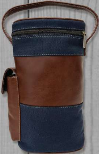
Dockside Wine Case #94186 (12.5" x 7" x 3.75")