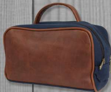
Cabin Dop Kit #95081 (10"x 6"x 7")