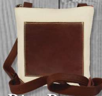
Riva Purse #95193 (7" x 8")