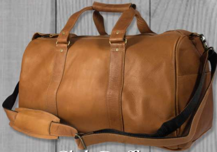
Club Duffle #90172 (20"x 9"x 10")