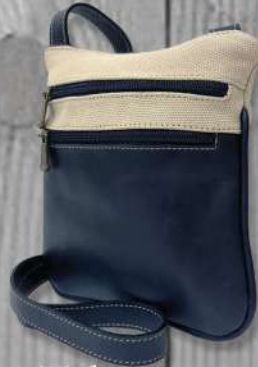
Tula Purse #99349 (7"x 8")