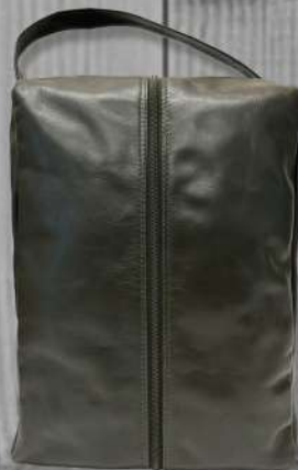
Fairway Shoe Bag #98169S (9.25" x 4.5" x 13.5")