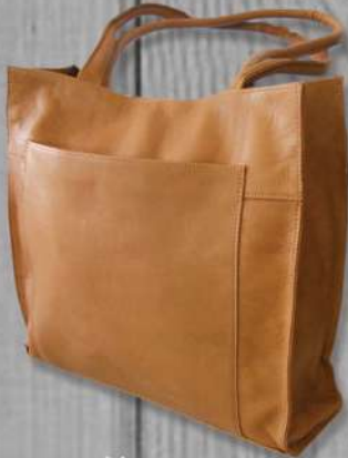
Village Tote #95419 (12.5" x 12" x 4")