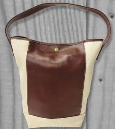
Cart Tote #95390T (7"x 9"x 5.5")