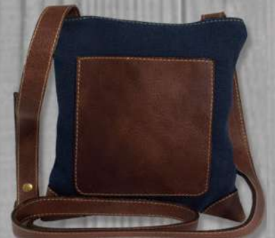
Marina Purse #91193 (7" x 8")