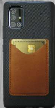
Phone Billfold #95247 (2.5" x 3.5")