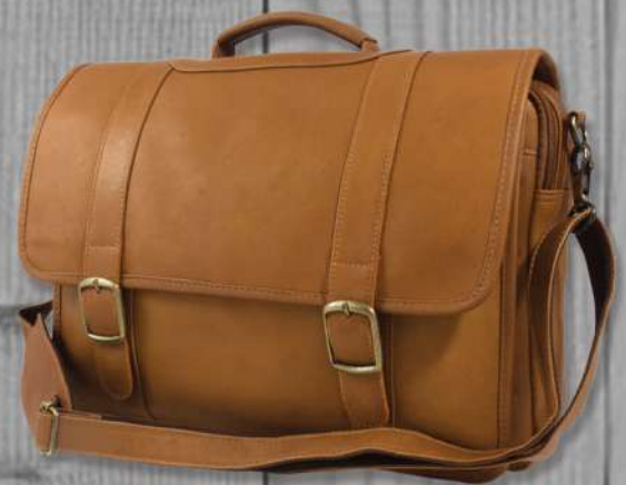
Notebook Case #91199 (15" x 12" x 3.5")