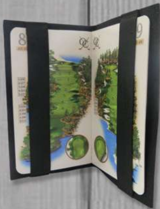
Yardage Cover (Book) #94956 (4.5" x 7.5" Closed)