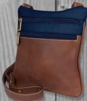
Cayman Purse #94349 (7"x 8")