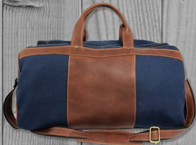
Starboard Duffle #93001 (19"x 11"x 11")