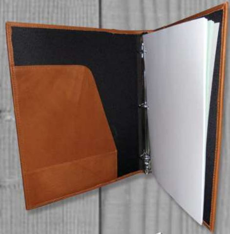
Big Binder #90233 (9.75" x 1.5" x 11.75")