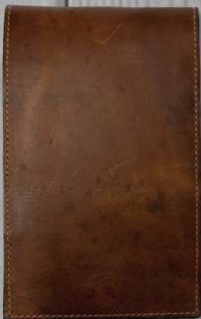
Wrangler Yardage Cover #95494 (7.5"x 4.5" Closed)