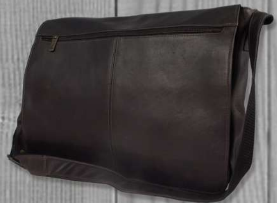
Mail Bag #91899 (16" x 11.5" x 4")