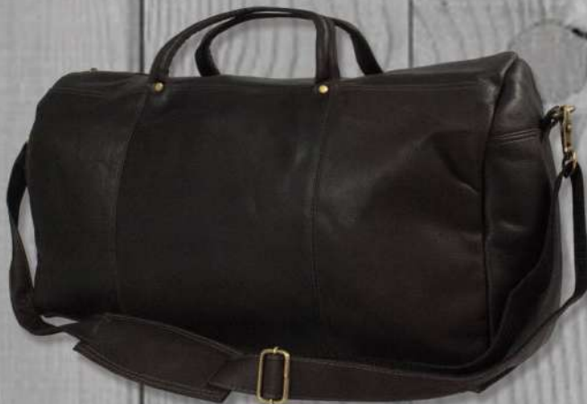
Basic Duffle #95110 (19"x 8.5"x 11")