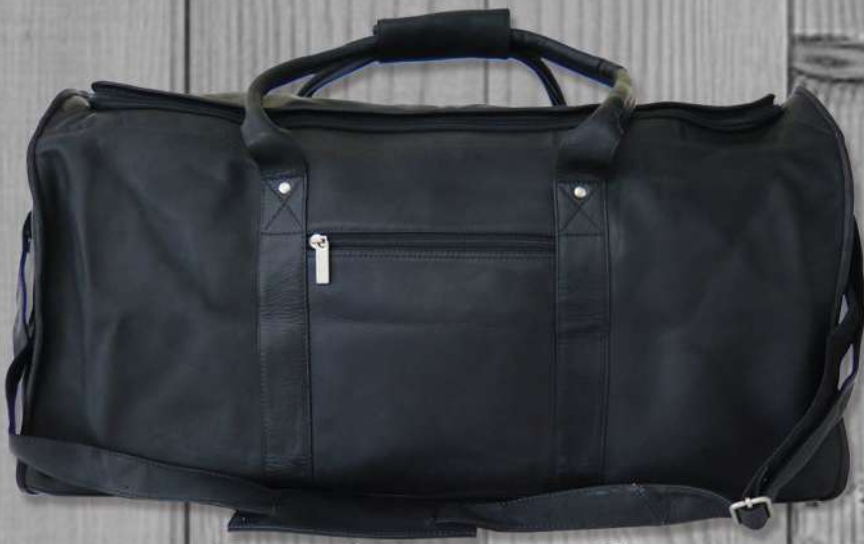
Expedition Duffle #93049 (25" x 10" x 14")