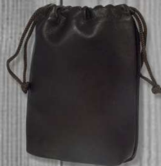
T-Plus Valuables Pouch #90103 (6.75" x 5.25")