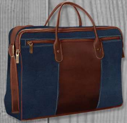
Topside Brief #93789 (15" x 4.5" x 11")