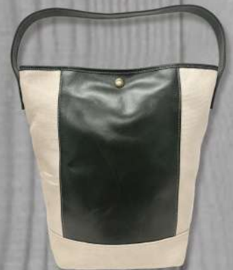
Cart Tote #95390S (7"x 9"x 5.5")