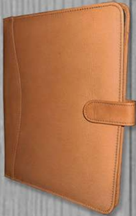
Tablet Cover #95008 (8" x 9.75")