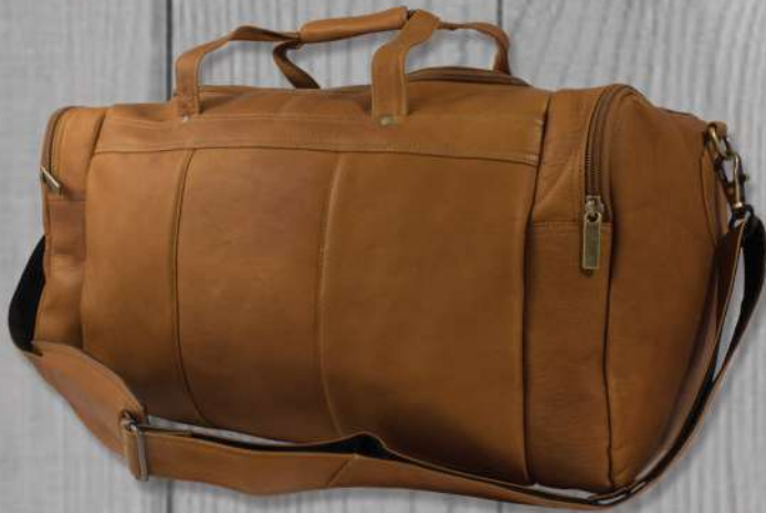
Huntsman Duffle #95094 (19.5" x 9.5" x 10")