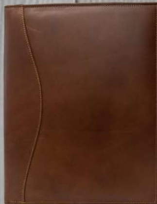
Denver Portfolio #95600 (9.5"x 12.5")