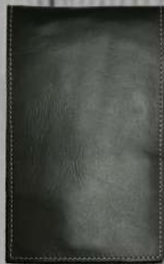
Eagle Yardage Cover #922941S (4.5" x 7.5")