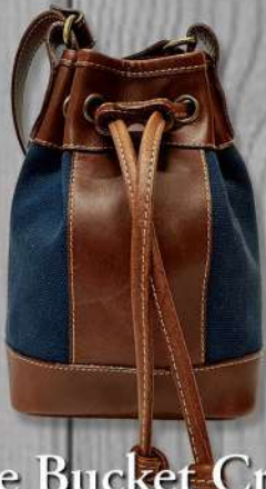
Brooke Bucket Crossbody #94277 (11" x 8.5" x 5")