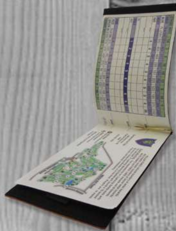
Clip Scorecard (Flip) #94928 (7.5" x 4.5" Closed)