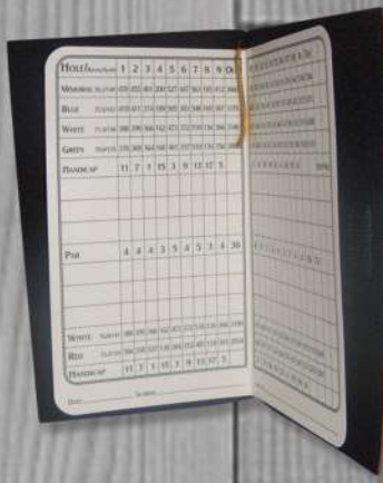
Birdie Clip Card Holder #92514 (6.5" x 4.5")