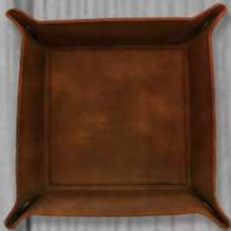
Alamo Tray #95906 (5" x 5")