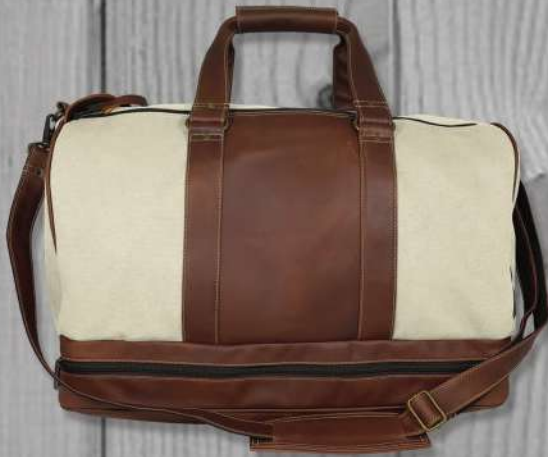
Calypso Duffle #90510 (20" x 10.5" x 12")