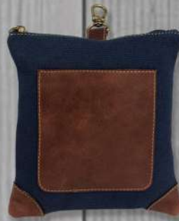
Leeward Pouch #91190 (7" x 8")