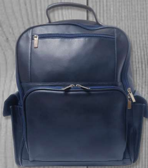
Primo Knapsack #98352 (14"x 8"x 17")