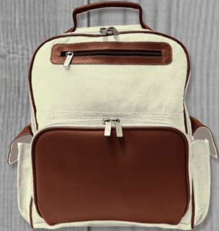
Cabo Backpack #94452 (15" x 8" x 17")