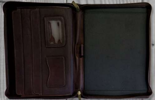
Zipper Portfolio #96089 (13" x 9.5" x 1.25")