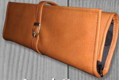
Jewel Case #94999 (9" x 4" x 2")