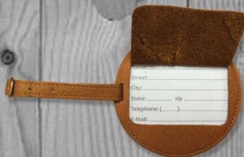
Luxe Bag Tag #95234 (4" Diam)