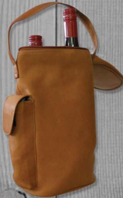
Double Wine Case #91186 (12.5" x 7" x 3.75")