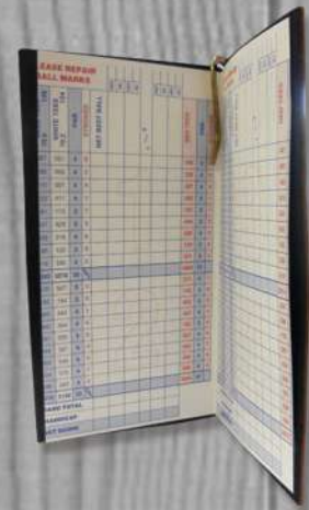
Clip Scorecard (Book) #94929 (4.5" x 7.5" Closed)