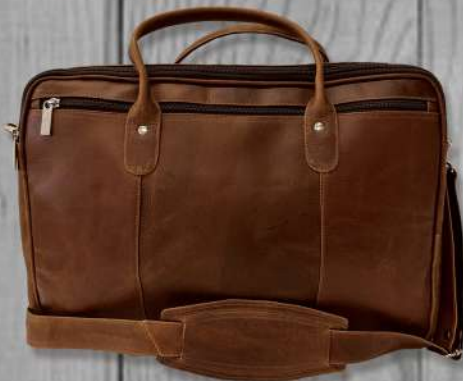
Wyatt Brief #95178 (15" x 4.5" x 11")