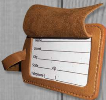
Luggage Tag #94807 (5" x 2.5")