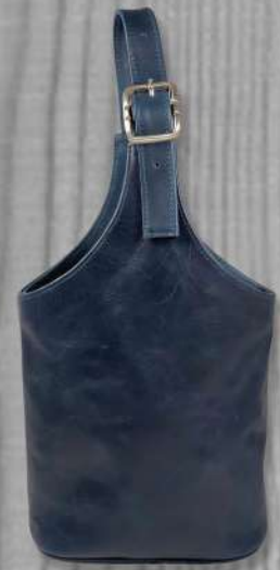
Luna Wine Case #92525 (7.5"x 4"x 15.5")