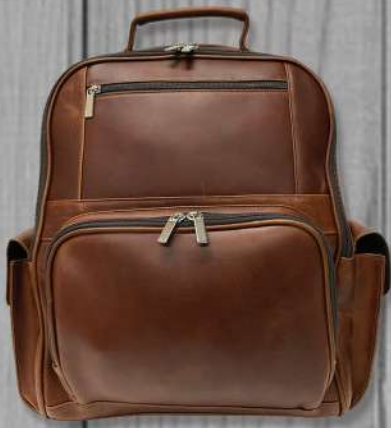
Outlaw Backpack #95352 (14" x 8" x 17")