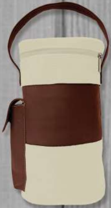
Bimini Wine Case #94496 (12.5" x 7" x 3.75")