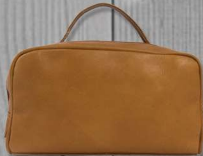
Dop Kit #95089 (10" x 6" x 7")