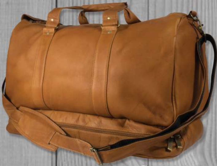
Summit Duffle #90110 (20"x 10.5"x 12")