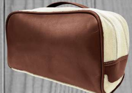
Havana Dop Kit #94494 (10" x 6" x 7")