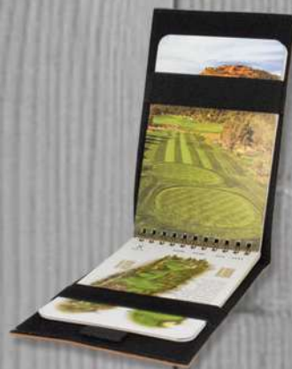
Yardage Cover (Flip) #94941 (7.5" x 4.5" Closed)