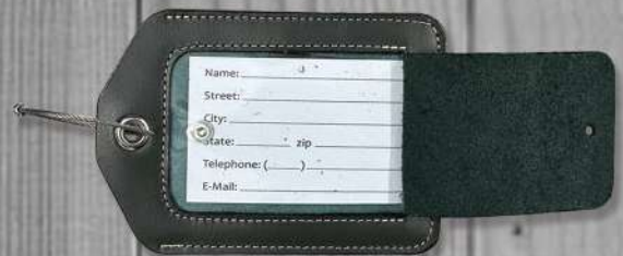
Founders Luggage Tag #95279S (5.5" x 4")