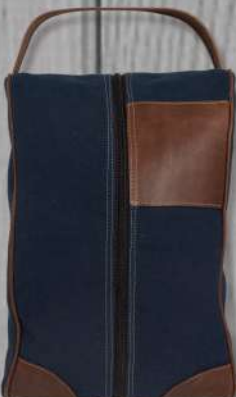
Charter Shoe Bag #94691 (9.25"x 4.5"x 13.5")