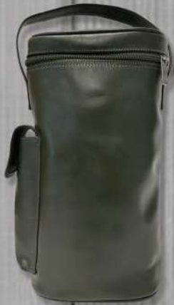
Amor Wine Case #92186S (12.5" x 7" x 3.75")