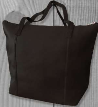
Shop Tote #95409 (11.5" x 5" x 12.5")