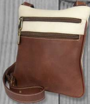
Rio Purse #95349 (7"x 8")