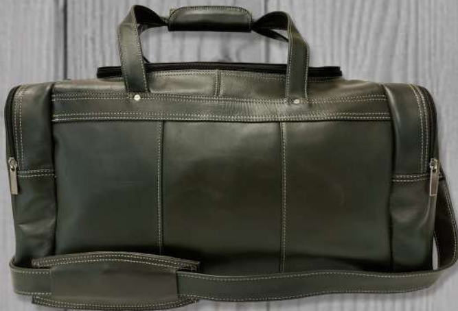
Marquis Duffle #92594S (19.5" x 9.5" x 10")