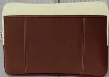
Freeport Sleeve #91252 (15" x 10.5")