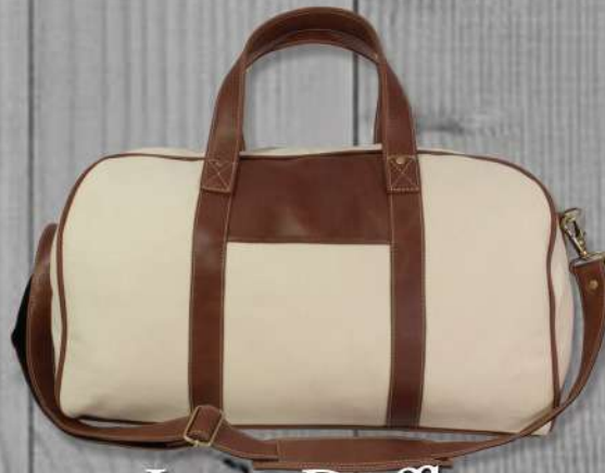
Luau Duffle #94089 (18" x 8" x 12")