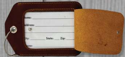
Founders Luggage Tag #95279 (3.5" x 5")