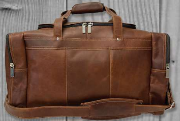
Roswell Duffle #95594 (19.5" x 9.5" x 10")