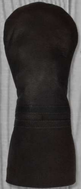
Wood Cover #95186 (5.5" x 3.5" x 13")