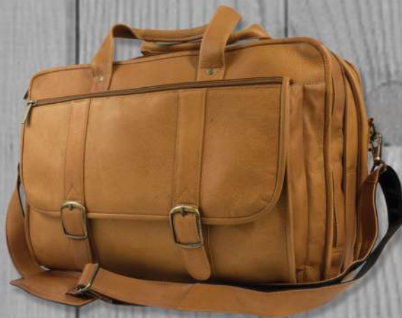
Partners Brief #91009 (17" x 13.5" x 8.5")