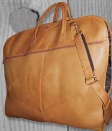
Regent Garment Bag #92169 (23.5" x 42" x 1.5")