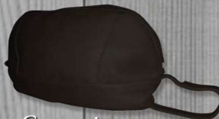
Cosmetique #94199 (10" x 6" x 4")