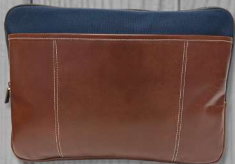
Castaway Sleeve #93526 (15"x 10.5")