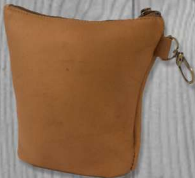
Zip Pouch #95289 (7" x 6.5" x 1.5")