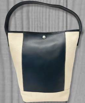
Cart Tote #95390B (7"x 9"x 5.5")