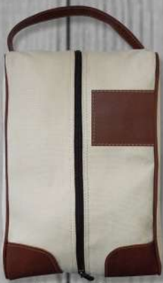
Paradise Shoe Bag #90469 (9.25"x 4.5"x 13.5")