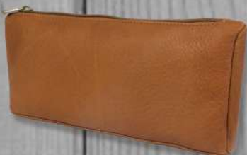
Omni Pouch #95045 (10.5" x 1.5" x 5.25")