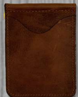
Renegade Billfold #93155 (4"x 2.75")