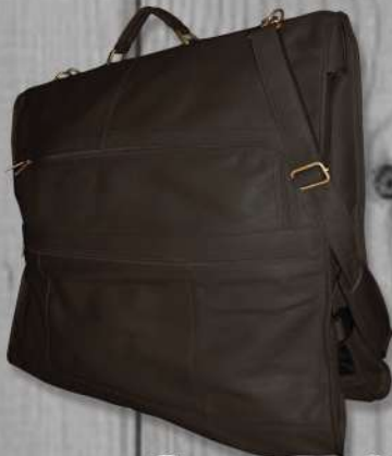
Reserve Garment Bag #92039 (24" x 42" x 3")