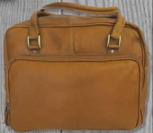
To Go Bag #94703 (17" x 13" x 7")