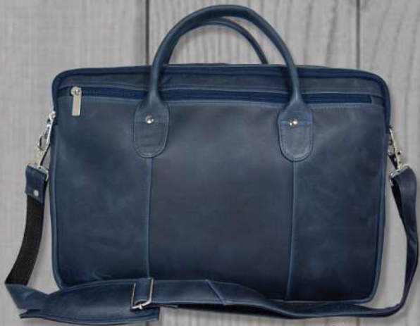
Pacesetter Brief #92178 (15"x 4.5"x 11")