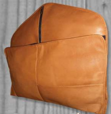
Garment Sleeve #90163 (24" x 39" x 1")