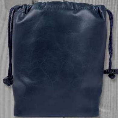
Monte Pro Pouch #92493 (7.5" x 3.5" x 7.5")