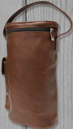
Boone Double Wine #95696 (12.5"x 7"x 3.75")