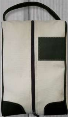
Nova Shoe Bag #99691S (9.25"x 4.5"x 13.5")