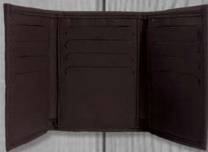
Milo Trifold #92659 (9.5" x 4")