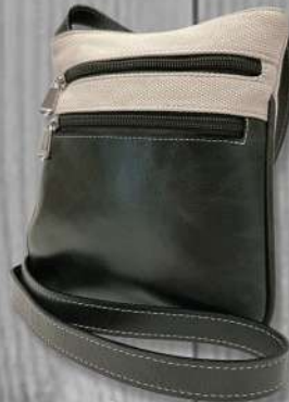
Tula Purse #99349S (7"x 8")