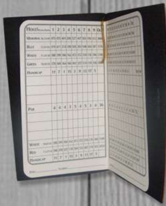
Pocket Clip Scorecard #95140 (6.5" x 4.5")