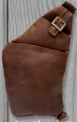
Cassidy Sling Pouch #95274 (14" x 8.5")