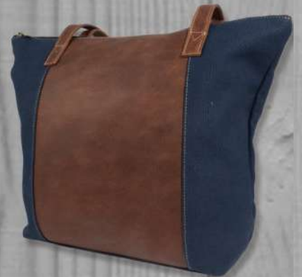
Port Tote #95401 (11.5" x 5" x 12.5")