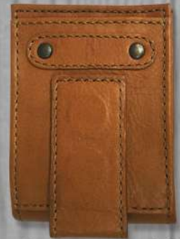
Cayo Magnetic Wallet #93319 (4" x 3")