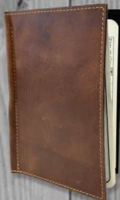
Carson Pocket Clip #95514 (6.5"x 4.5")