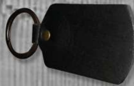
Key Fob #94776 (2.5" x 1.5")