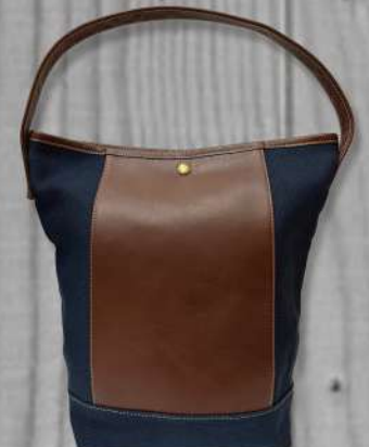
Cart Tote #95390 (7"x 9"x 5.5")