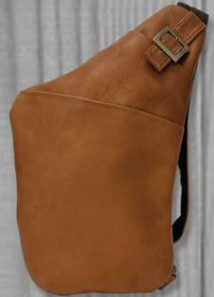
Truckin Sling Pouch #90274 (14" x 8.5")