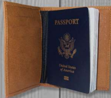
Passport Wallet #95191 (4.5" x 5.5")