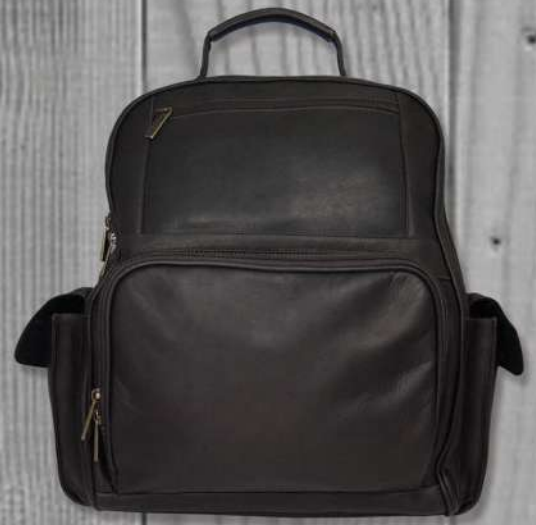
Jet Backpack #93529 (14" x 8" x 17")