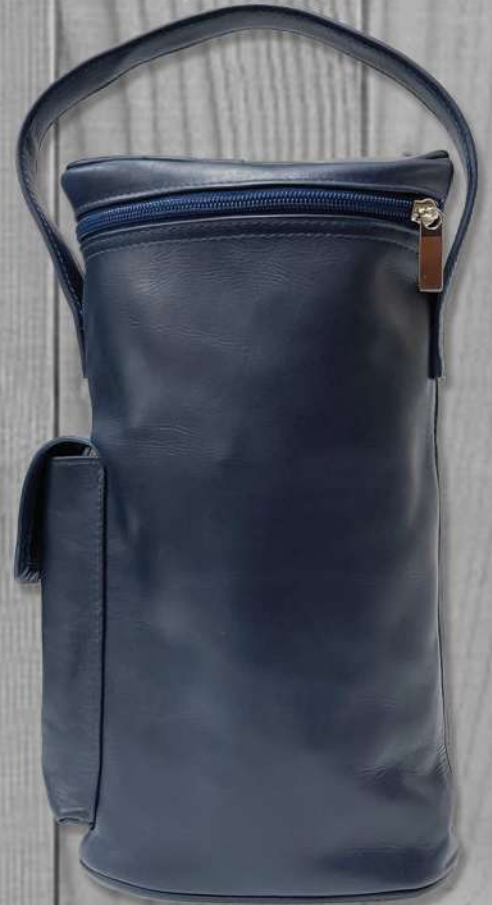
Amor Double Wine Case #92186 (12.5" x 7" x 3.75")