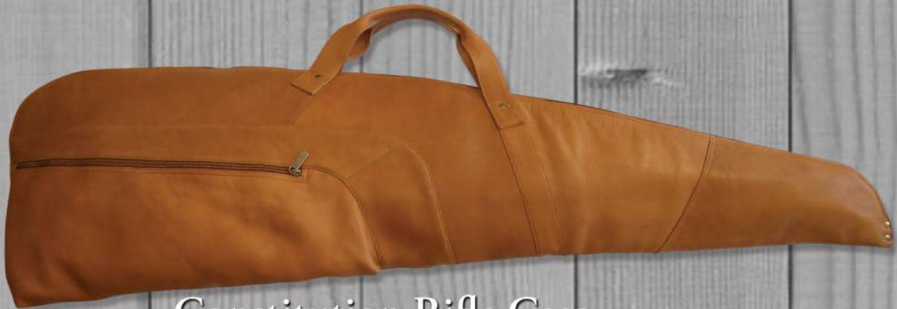
Constitution Rifle Case #95092 (48" x 13.5")