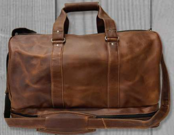
Bronco Duffle #90310 (20" x 12" x 10.5")