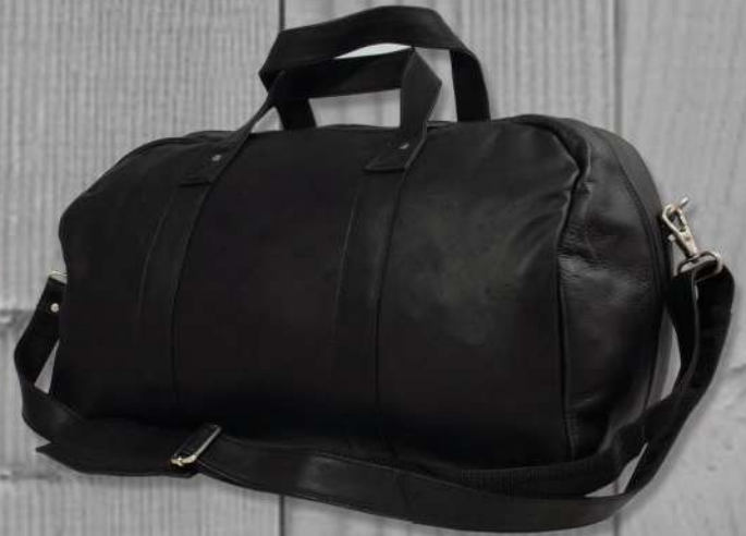
Tour Duffle #93089 (18"x 12" x 8")