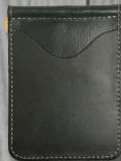
Chill Billfold #92155S (2.75" x 4.5")