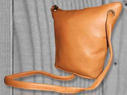
Zip Pouch Purse #95189 (6.5" x 7")