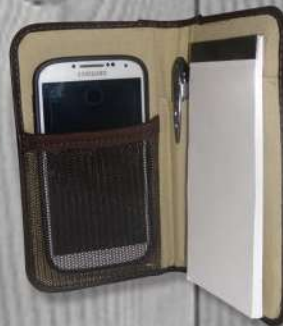
Smart Pocket Plus #92506 (4.5" x 7")