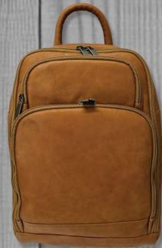
Journey One Strap Backpack #90275 (15" x 11" x 4.5")