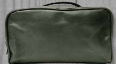
Turo Dop Kit #92508S (10" x 6" x 7.5")