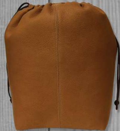
Shag Bag #94726 (8.25" x 9.5" x 3.5")