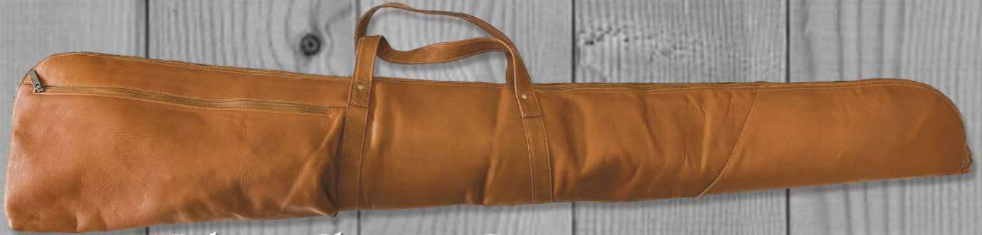
Liberty Shotgun Case #95091 (53" x 10")