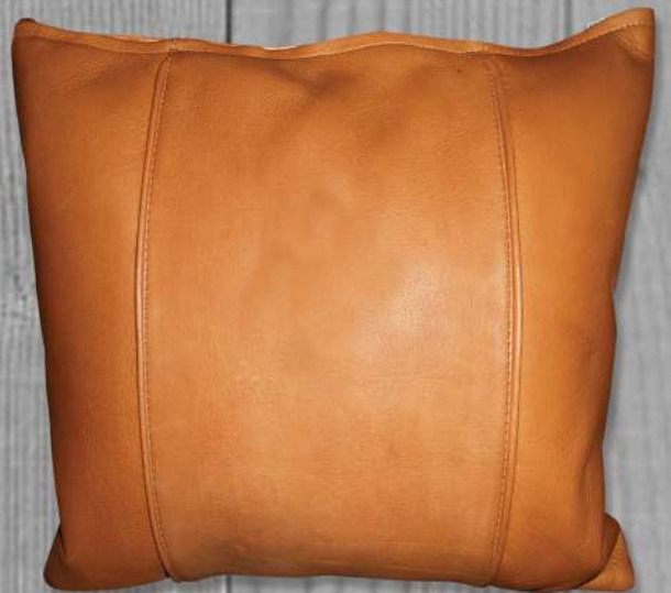
Large Pillow #94901 (18" x 8" x 18")