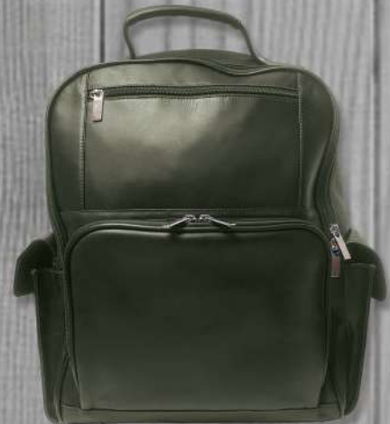
Primo Knapsack #98352S (14" x 8" x 17")