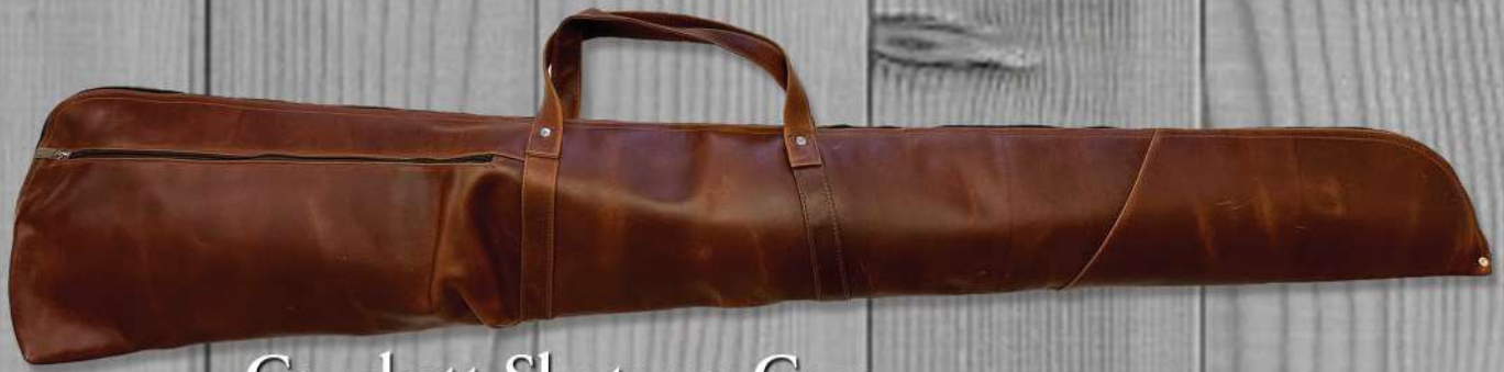
Crockett Shotgun Case #95591 (53" x 10")