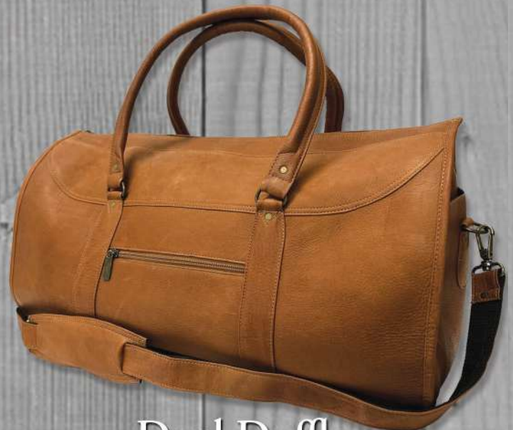
Dual Duffle #93079 (20.25"x 9"x 10")