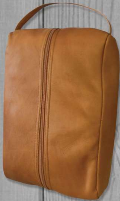
Shoe Bag #90169 (9.25" x 4.5" x 13.5")