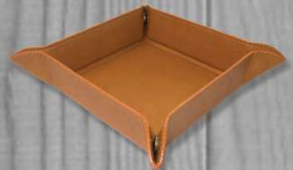
Tray #94906 (5" x 5")