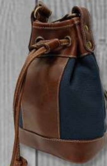
Betsy Mini Bucket #94276 (8" x 5.5" x 3.5")