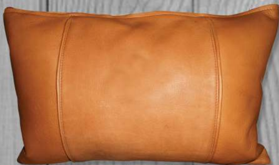
Small Pillow #94902 (18" x 7" x 12")