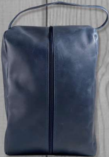
Fairway Shoe Bag #98169 (9.25"x 4.5"x 13.5")