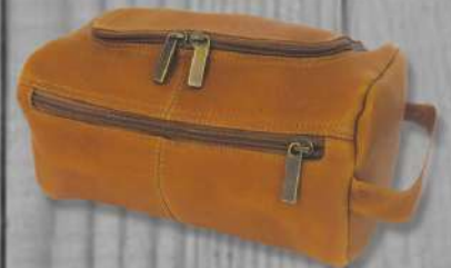
Groomsman Kit #94179 (10" x 5" x 6")