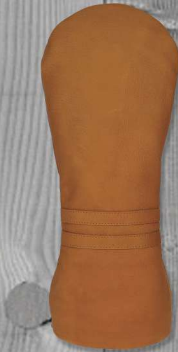
Driver Cover #95286 (7" x 4.5" x 15.5")